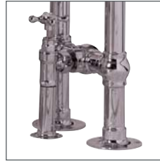
Face to Face Tappings (mm)

Sleeving kits to hide pipework: SK15 - please see page 62.