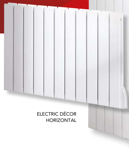
ELECTRIC DÉCOR HORIZONTAL

The electric DÉCOR is a stylish, contemporary alternative to a traditional radiator. An electric version of our popular hydronic model, the distinctive flat tube design will enhance the look of any room. It is suitable for a wide range of uses, both domestic and commercial. It is also perfect for projects that are off-gas or have no central heating pipes installed.