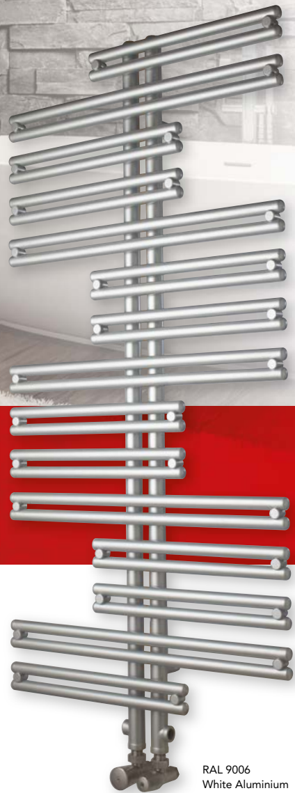
RAL 9006 White Aluminium

A striking and highly individual round tube radiator, KASAI demands to be noticed. It is a versatile choice and will make a strong addition to a bathroom or living space. It is available in selected RAL or metallic colour finishes to ensure that, whatever your décor, the KASAI will enhance your home.