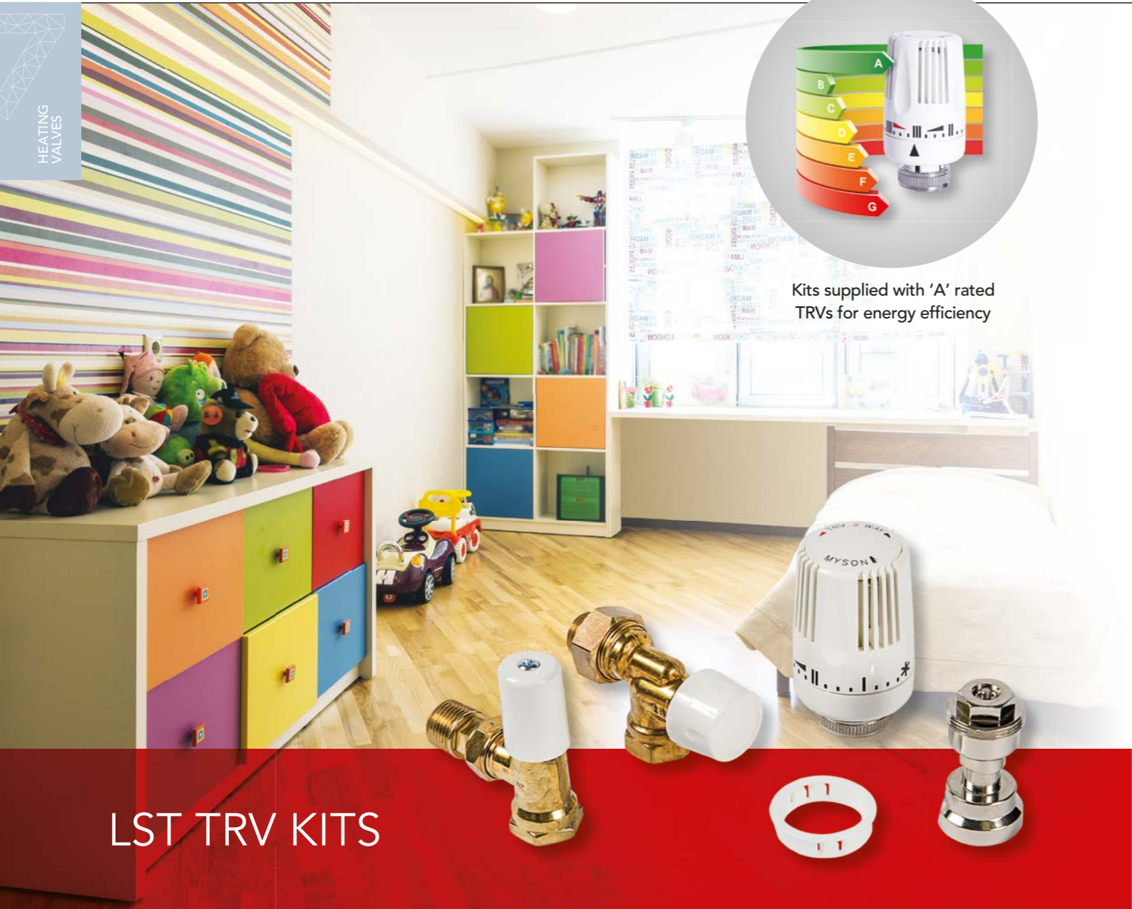
Kits supplied with 'A' rated TRVs for energy efficiency